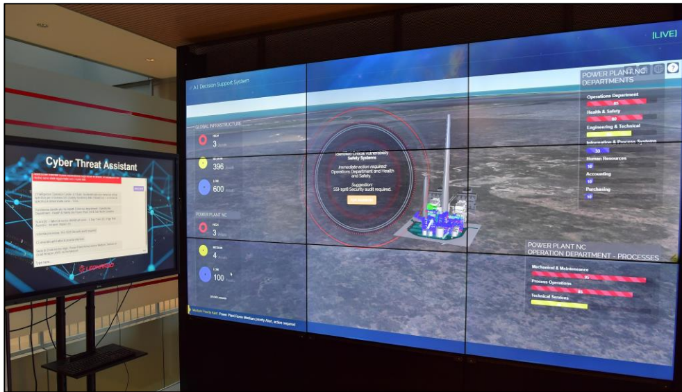
Leonardo Intelligence Operation Center

The Threat Intelligence Service is provided free of charge for 2 months to the first 100 companies that apply. You will need to complete a consent form in which the applicant provides ID information (full name, e-mail address), as well as some significant information on the nature of the company concerned for the purposes of better profiling.